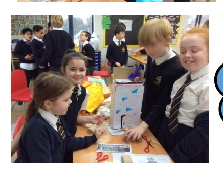
I think this photo proves being back at school and doing Science makes you very happy!

We tried testing our buildings with the fan but didn't feel it represented the force of a hurricane so we tried some more extreme measures!