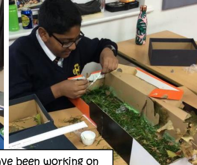
Class 6 have been working on their Shoebox Museums.