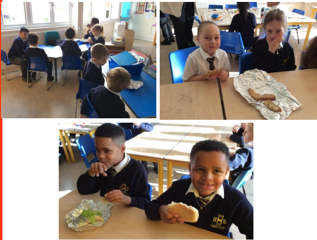
3 Robins healthy sandwiches