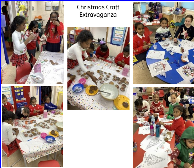
Christmas Craft Extravaganza