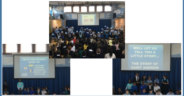
Year 4-St Andrew's Day Assembly