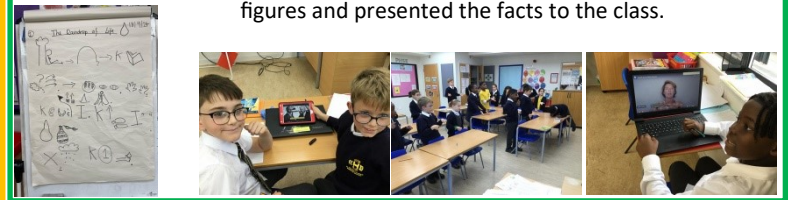
6A applying their knowledge to the reading of different scales

We have been using laptops and iPads to research 'Black History Month' this week. The children wrote down their own notes for different significant figures and presented the facts to the class.