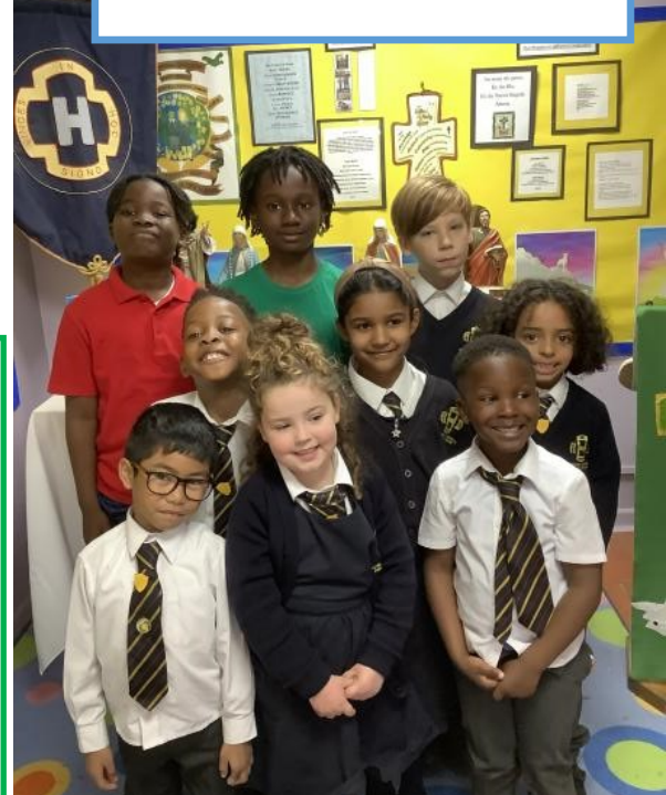
Welcome to our new Eco Council