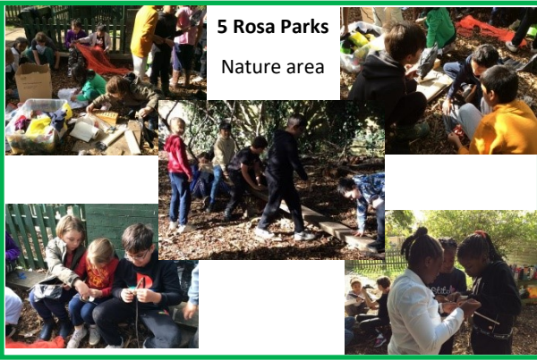
5 Rosa Parks Nature area