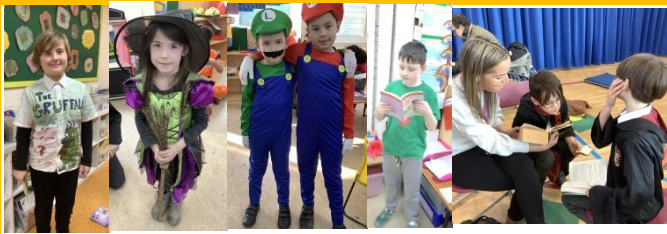
World Book Day– whole school reading event

On Wednesday, the Science Ambassadors gathered together in preparation for next week - Science week. They learnt about moths which have changed colour over time to camouflage with their environment and be less available to their predators. The Science Ambassadors discussed the Science behind this and are now ready to teach their own class next week. Whilst learning, they had to camouflage their own moth and hide it somewhere in the studio. Can you spot them?