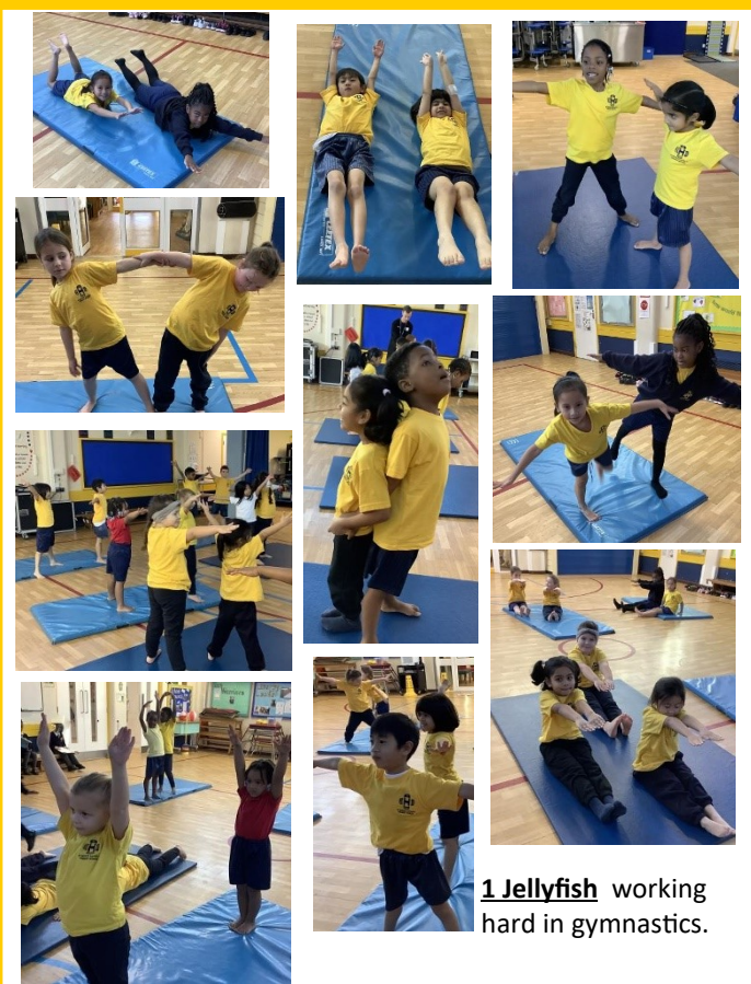
1 Jellyfish working hard in gymnastics.

Year 6 StR had a very busy and enjoyable morning in the Nature Area. Firstly, they explored and built dens for their groups. They made cheerio necklaces to feed the birds which is especially important in this cold weather. The highlight of the morning was making pizzas!