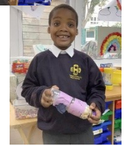
Rain makers by Seahorses