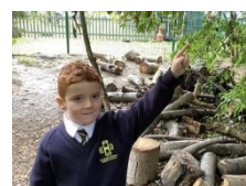
Jellyfish looking after God's creation