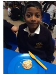
Jellyfish designing and making their face biscuits