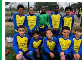
Well done to our Year 6 Football and Netball Teams for great results in the recent competition.