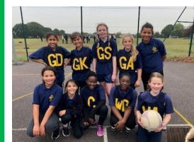
Well done girls - Bronze medal winners!