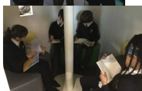
3 Seagulls – Library trip