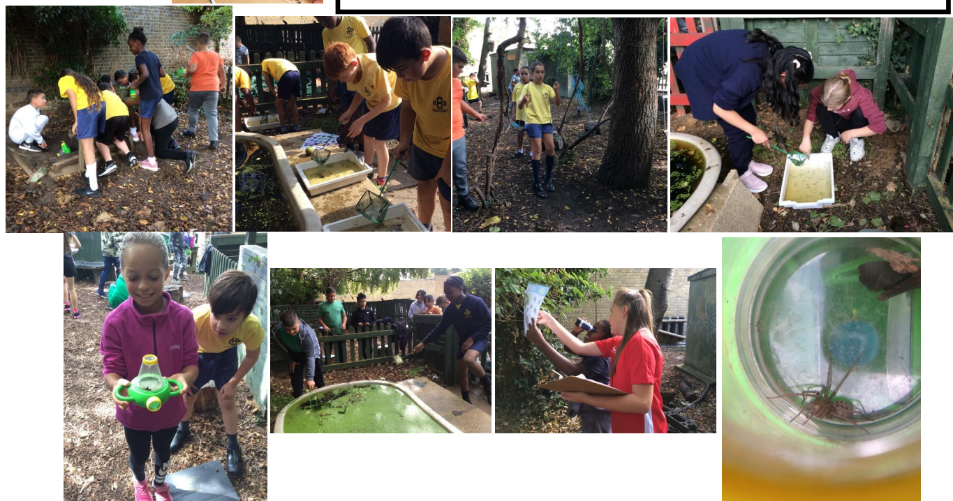
Year 6 having fun in the nature area