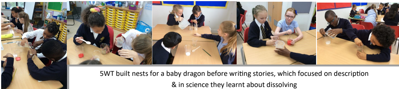
5WT built nests for a baby dragon before writing stories, which focused on description & in science they learnt about dissolving