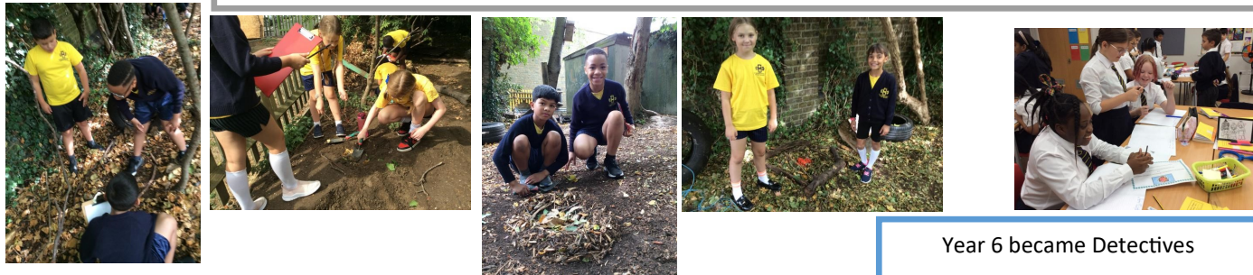
Year 6 became Detectives