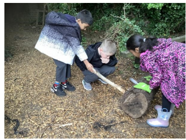
2 Oysters- Enjoying a lovely morning in the nature area.