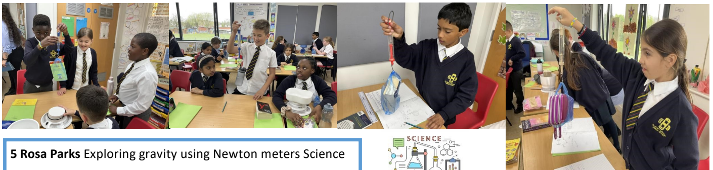
5 Rosa Parks Exploring gravity using Newton meters Science