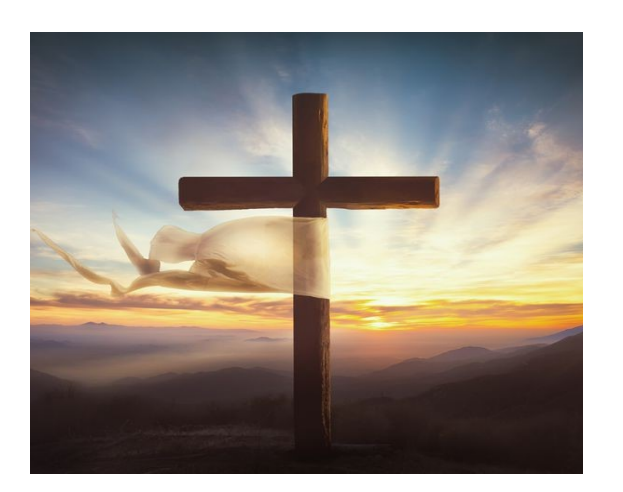
The Easter Mystery