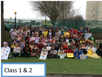
Class 1 & 2