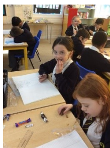
Class 3R had fun scientifically tasting chocolate!