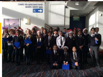
Years 5 & 6 choir at the Cliffs Pavilion. Well done to all the children for their lovely singing.