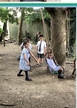
Year 2 Nature Area